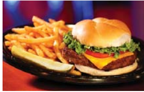
Bars / Ice Cream / Table Service / Quick Service