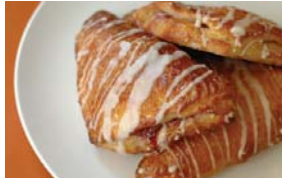
Dusty Environments Like Pizza and Bakeries