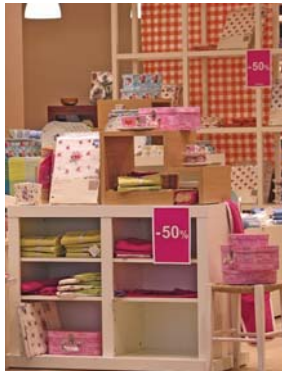
Cafeterias / Discount Stores