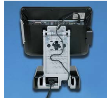
Integrated Power Supply and Cable Management Keeps Cords Hidden and Organized