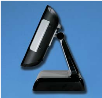
Sleek Cabinet Design