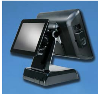
Optional Integrated 9.7" Rear LCD Customer Display