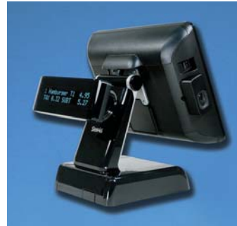
Optional Integrated Rear VFD Customer Display