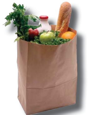
Convenience Stores / Small Grocery Stores