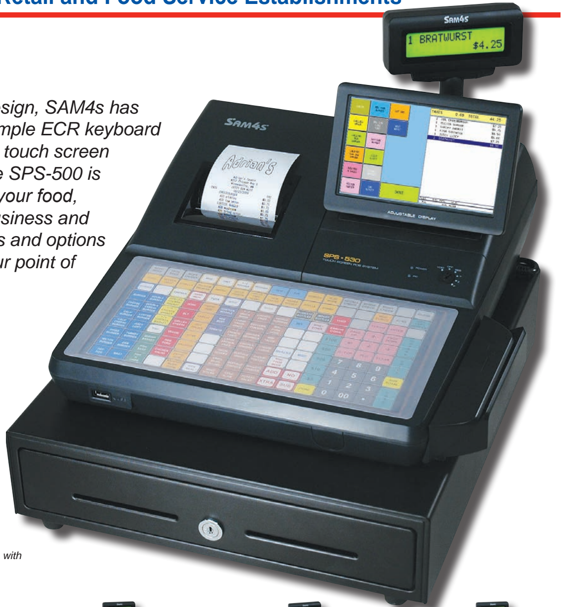
SPS-500 Series Hybrid ECRs Shown with Optional Card Reader

Featuring a hybrid design, SAM4s has combined fast and simple ECR keyboard entry with an intuitive touch screen operator display. The SPS-500 is easily configured for your food, beverage, or retail business and provides the functions and options you need to meet your point of service needs.